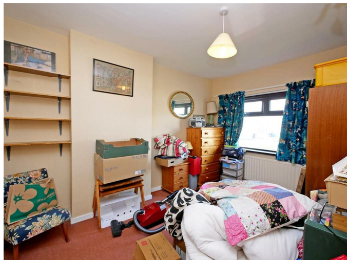
Bedroom 4 9'1" x 8'9" (2.78m x 2.69m)