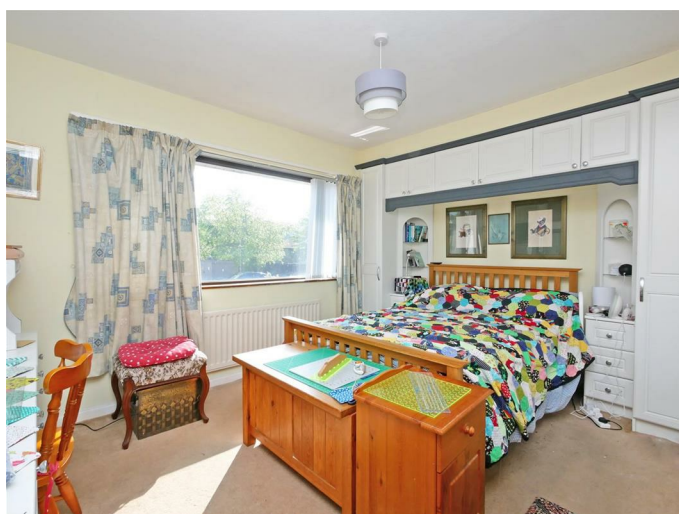
Bedroom 2 12'11" x 9'10" (3.96m x 3.01m)

Spacious double bedroom with built-in wardrobes.