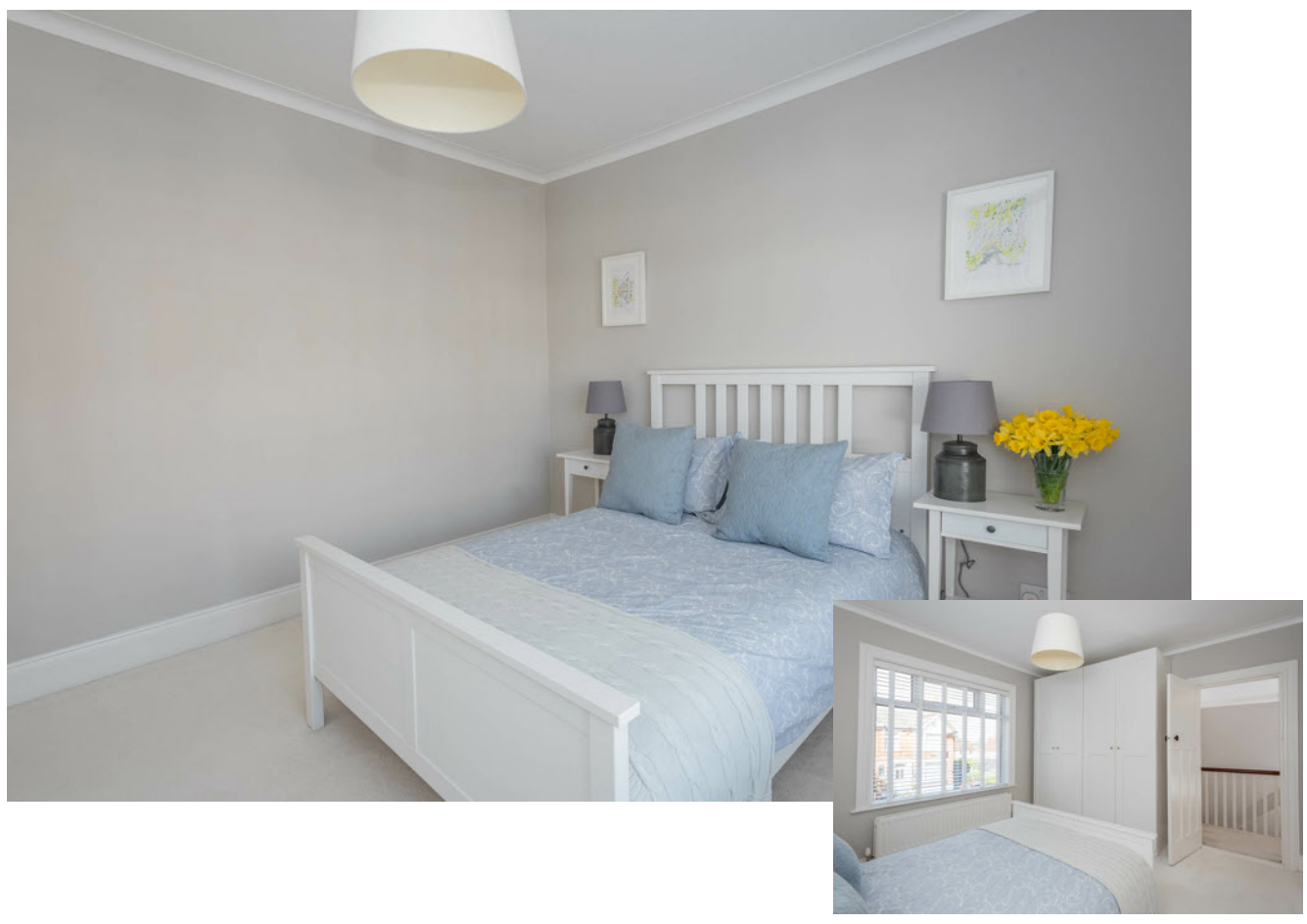
BEDROOM (2): 12' 1" x 10' 10" (3.68m x 3.3m) Cornice ceiling.