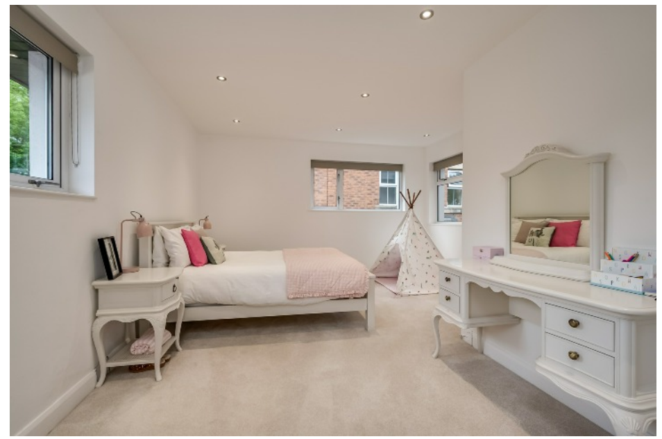
BEDROOM (4): 12' \ 0'' \times 8' \ 0'' (3.66m x 2.44m) Mature outlook to rear garden. Views to RBAI playing fields. Built-in cupboard, low voltage spotlights.

BEDROOM (3): 17' 10" x 13' 0" (5.44m x 3.96m) (at widest points). Triple aspect windows.