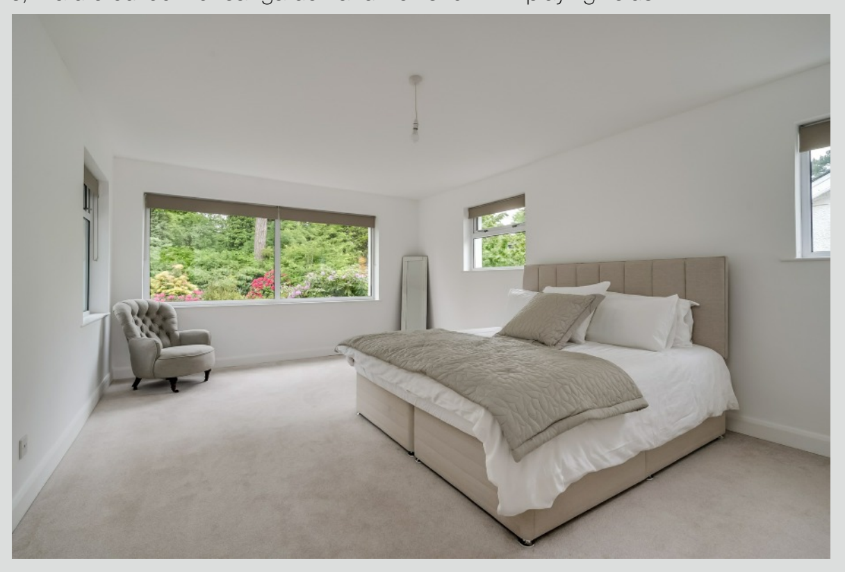
BEDROOM (2): 17' 5" x 12' 9" (5.31m x 3.89m) Storage into eaves.

BEDROOM (1): 19' 1" x 12' 10" (5.82m x 3.91m) Built-in wardrobes and cupboards. Dual aspect windows, mature outlook to rear garden and views to RBAI playing fields.