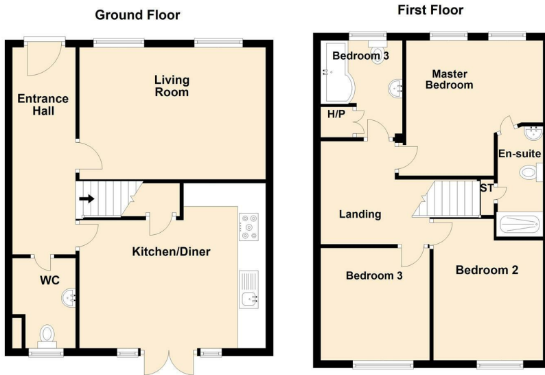
15 Meadow Crescent, Lisburn

Contact HMK today for a free property valuation 02890397712