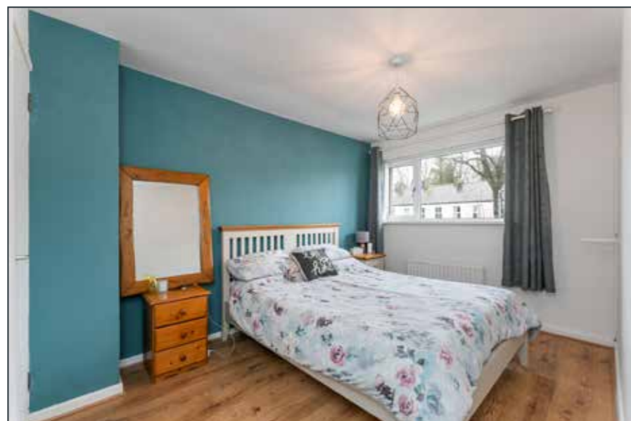
BEDROOM (1): 10' 5" x 8' 8" (3.18m x 2.64m) Polished laminate floor, view to the Mill Village to the rear.