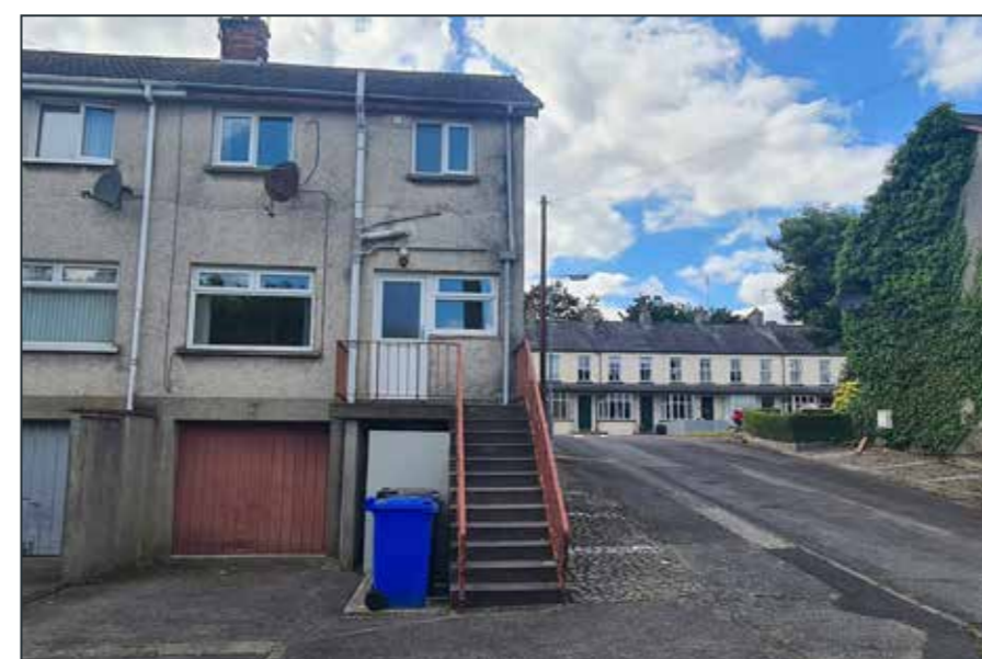
STORE: 13' 4" x 5' 2" (4.06m x 1.57m) Electric and light.