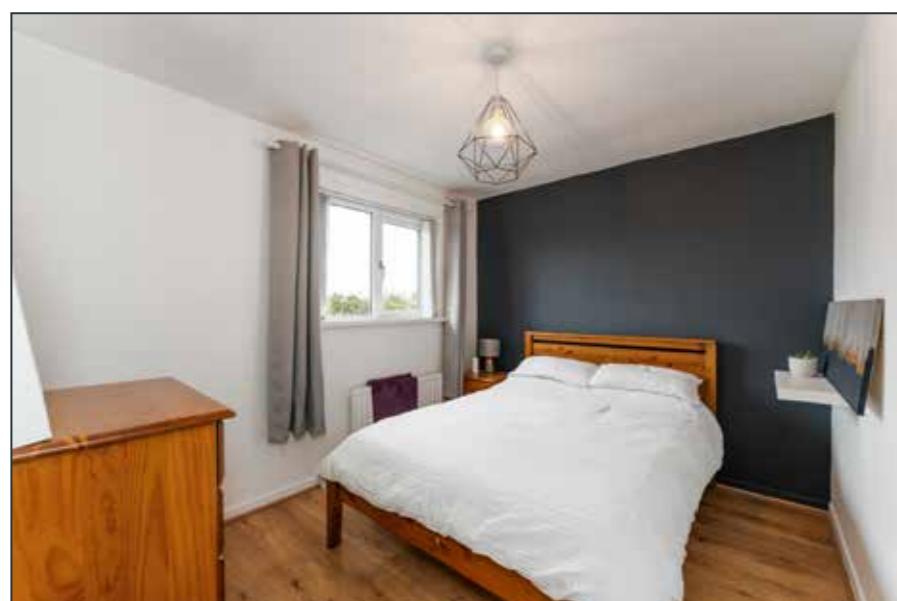
BEDROOM (2): 12' 3" x 8' 10" (3.73m x 2.69m) Polished laminate floor, built in robes.