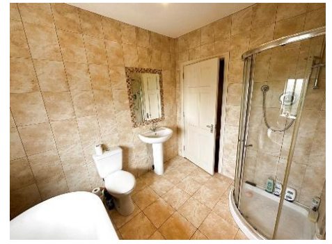
Bedroom & Main Bathroom