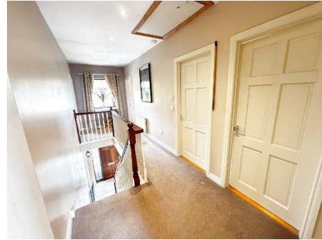
Attic space floored out, with Staire from the landing.