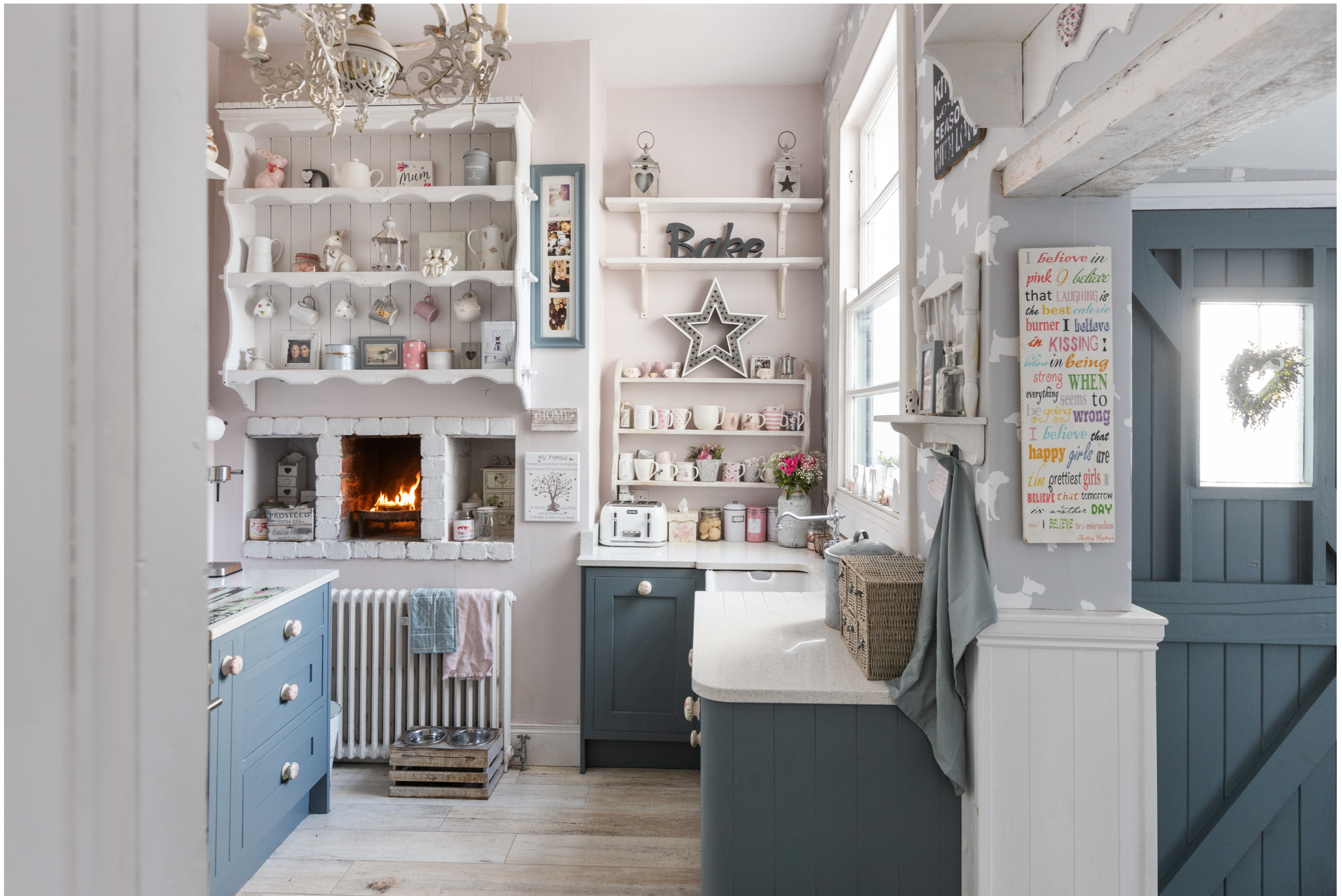
Individually designed kitchen