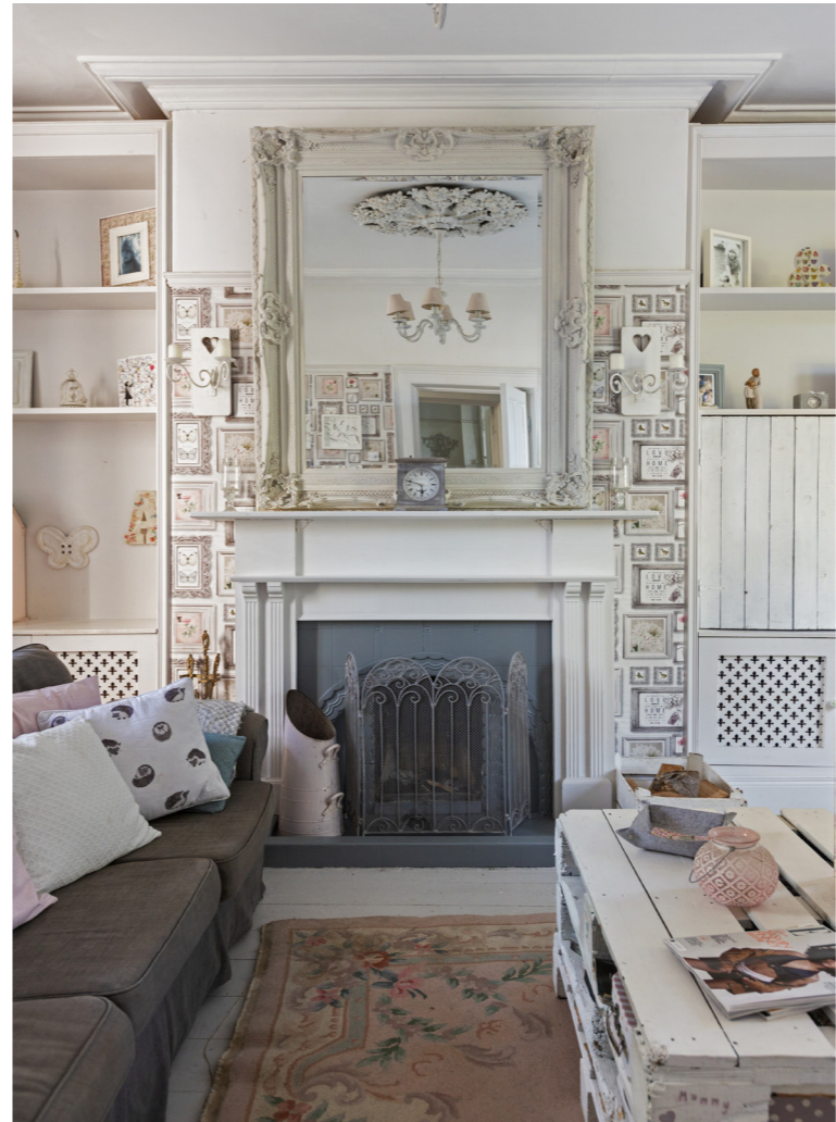
Drawing room fireplace