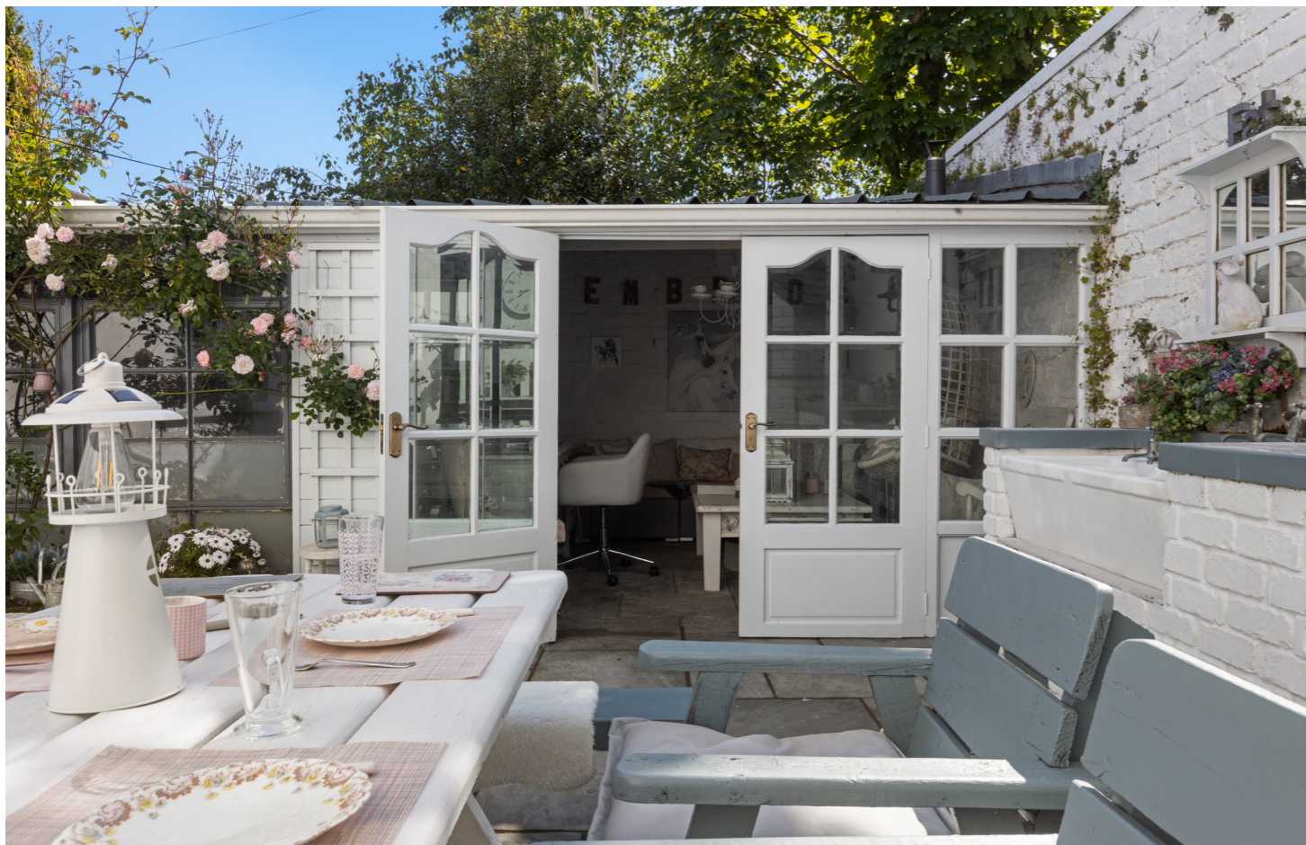
Outdoor entertaining area