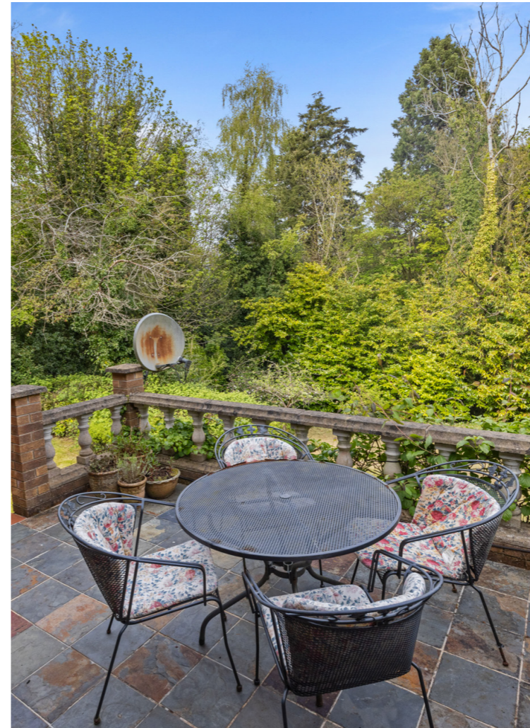
raised terrace off the living room