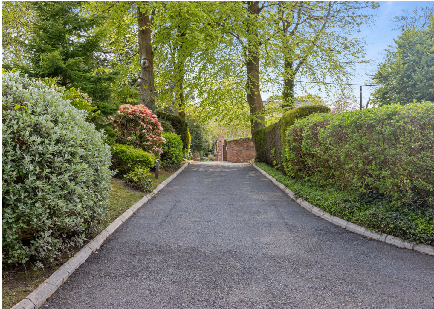
Driveway leading to the house