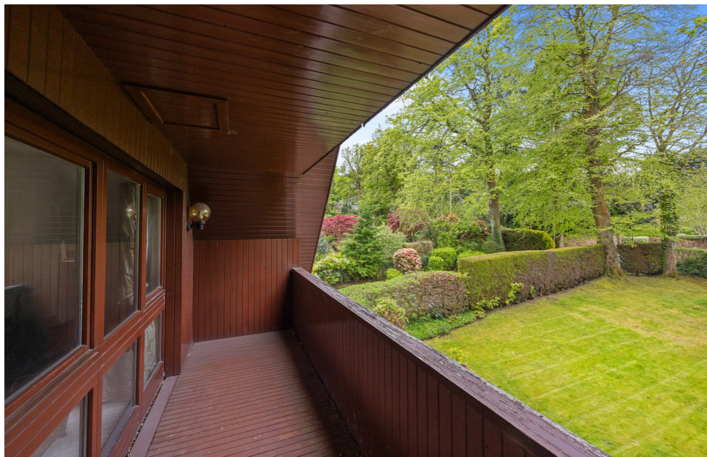
Open covered balcony