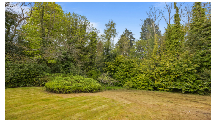
Large rear garden