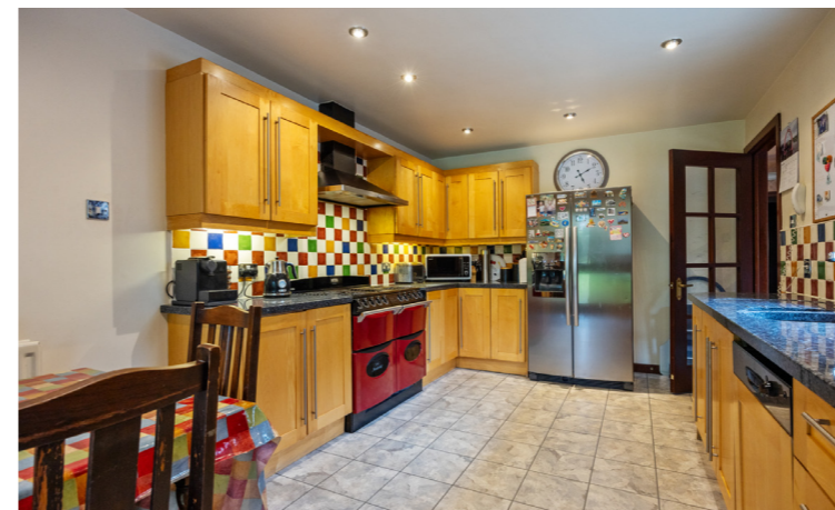
Kitchen with casual dining