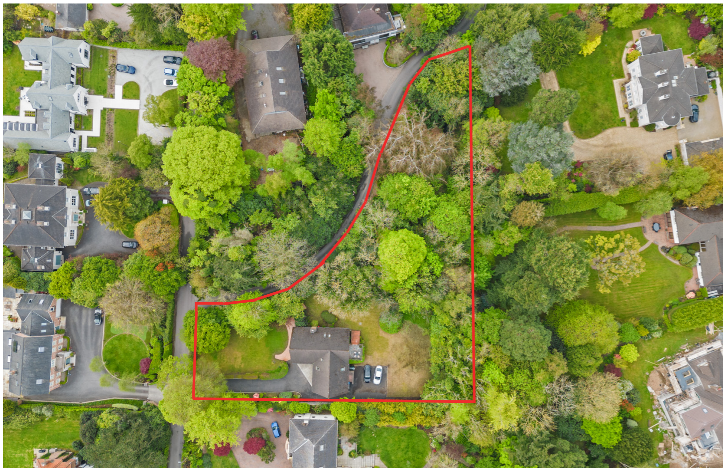
Overview image of the land (please note this is not to scale and for identification purposes only)