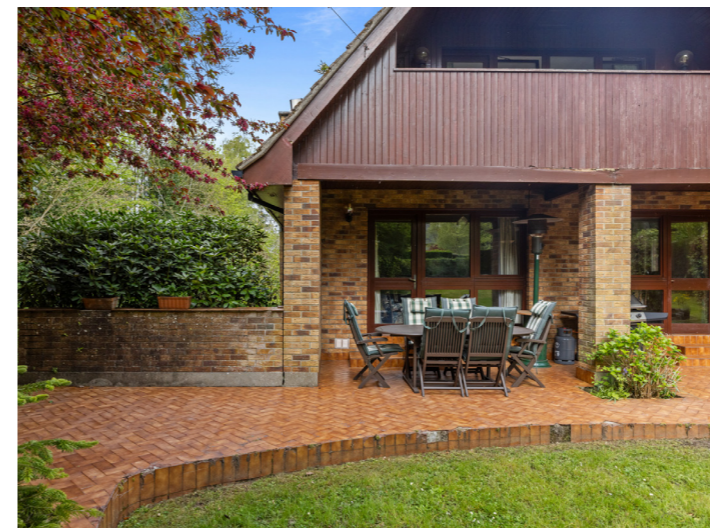
South facing patio area