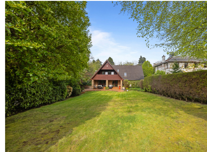
South facing garden with patio area