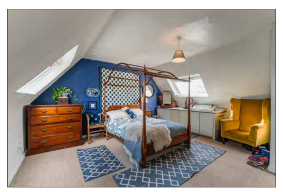
BEDROOM (1): 16' 2" x 14' 11" (4.93m x 4.55m)

Feature low windows, 2 large velux windows with black out blinds, far reaching countryside views.