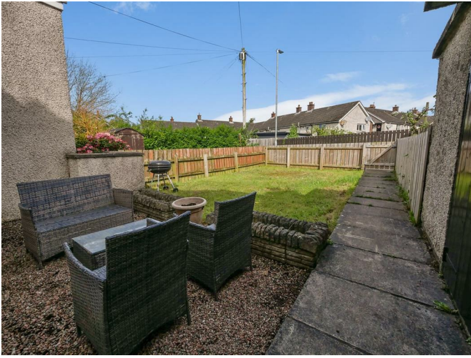
Gardens to the rear laid in lawn with additional loose stone area, outhouse with storage