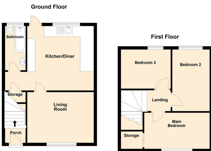
2 Rodney Drive, Belfast

Contact HMK today for a free property valuation 02890397712