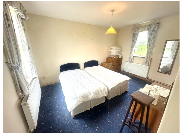
Bedroom 3: 3m x 3.2m Double bedroom with carpet flooring.