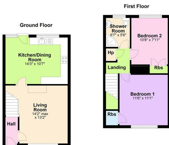
20 Hillcrest Drive, Ballynahinch

Terms & Conditions: Please note that these particulars do not constitute an offer or contract of sale. Any prospective purchaser should satisfy themselves by thorough inspection of the property and we recommend that any prospective purchaser should employ the professional services of a building surveyor and consider their findings prior to entering into contract. All such fees associated with this work will be the responsibility of the prospective purchaser regardless of whether the sale completes or not. In addition, none of the appliances or installations have been tested in any way whatsoever and it is our recommendation that a purchaser should fully satisfy themselves by employing an appropriate expert. We would also like to advise that our measurements are taken from the widest points of each room and should not be relied upon as completely accurate. You should not make decisions based on the measurements provided and double check measurements at all times. Valuation/Mortgage Service: As part of our service we would remind Vendors and potential purchasers that we have a Mortgage Broker available at this branch. If you are thinking of selling, we would be happy to carry out a free market appraisal of your property.