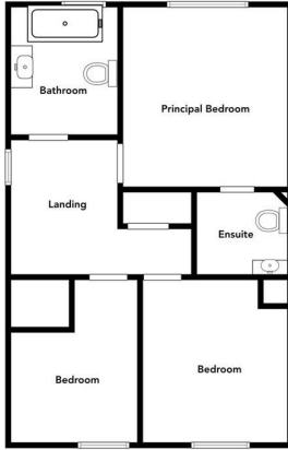
SIZES AND DIMENSIONS ARE APPROXIMATE.

Immaculately presented, three bedroom, Georgian style semi detached home, located within the well sought after Glen Corr development, Ballyclare Road, Glengormley, Newtownabbey. The property comprises entrance hall, furnished cloakroom, lounge with wood burning stove, kitchen through dining room, modern fitted kitchen, three well-proportioned bedrooms, to include principal en suite, and deluxe family bathroom with contemporary, white, three piece suite. Externally, the property enjoys private driveway finished in decorative stone, and large, fully enclosed rear garden, finished in lawn and paved patio area. Other attributes include gas heating, PVC double glazing and convenient location. Early viewing highly recommended to avoid disappointment.