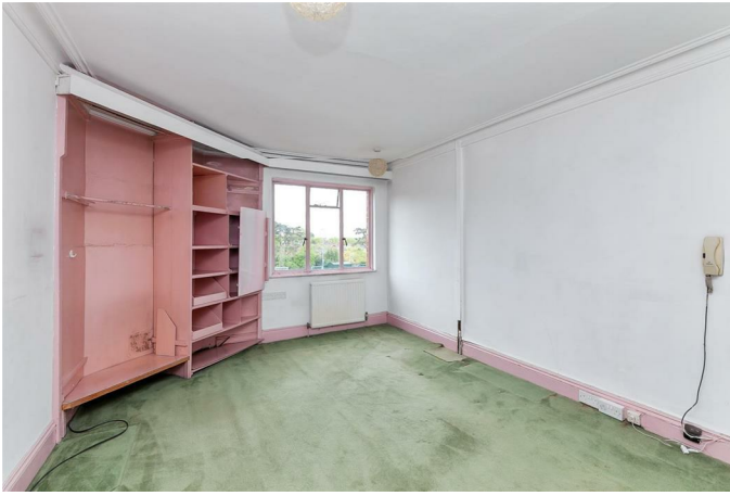
BEDROOM TWO 15'1" x 11'1" (4.6 x 3.4)