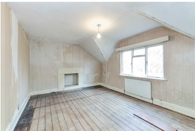
BEDROOM THREE 17'8" x 12'9" (5.4 x 3.9)