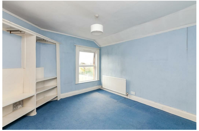
BEDROOM FOUR 12'1" x 10'5" (3.7 x 3.2)