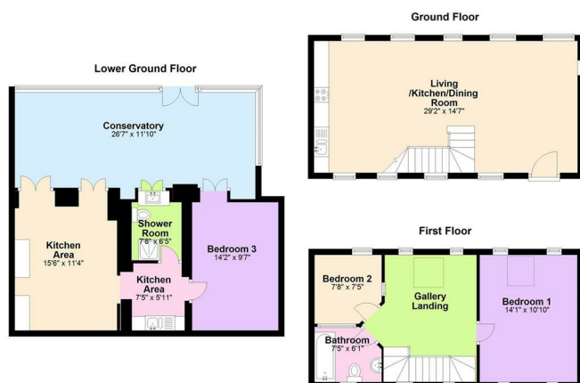
106 A+B Saul Street, Downpatrick

Terms & Conditions: Please note that these particulars do not constitute an offer or contract of sale. Any prospective purchaser should satisfy themselves by thorough inspection of the property and we recommend that any prospective purchaser should employ the professional services of a building surveyor and consider their findings prior to entering into contract. All such fees associated with this work will be the responsibility of the prospective purchaser regardless of whether the sale completes or not. In addition, none of the appliances or installations have been tested in any way whatsoever and it is our recommendation that a purchaser should fully satisfy themselves by employing an appropriate expert. We would also like to advise that our measurements are taken from the widest points of each room and should not be relied upon as completely accurate. You should not make decisions based on the measurements provided and double check measurements at all times. Valuation/Mortgage Service: As part of our service we would remind Vendors and potential purchasers that we have a Mortgage Broker available at this branch. If you are thinking of selling, we would be happy to carry out a free market appraisal of your property.