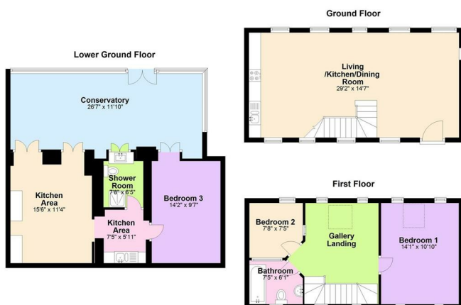
106 A+B Saul Street, Downpatrick

Terms & Conditions: Please note that these particulars do not constitute an offer or contract of sale. Any prospective purchaser should satisfy themselves by thorough inspection of the property and we recommend that any prospective purchaser should employ the professional services of a building surveyor and consider their findings prior to entering into contract. All such fees associated with this work will be the responsibility of the prospective purchaser regardless of whether the sale completes or not. In addition, none of the appliances or installations have been tested in any way whatsoever and it is our recommendation that a purchaser should fully satisfy themselves by employing an appropriate expert. We would also like to advise that our measurements are taken from the widest points of each room and should not be relied upon as completely accurate. You should not make decisions based on the measurements provided and double check measurements at all times. Valuation/Mortgage Service: As part of our service we would remind Vendors and potential purchasers that we have a Mortgage Broker available at this branch. If you are thinking of selling, we would be happy to carry out a free market appraisal of your property.