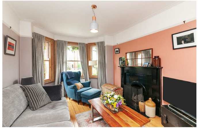
(into bay) Tiled fire-place with wooden surround housing an open fire. Floorboards sanded and varnished. Open to: