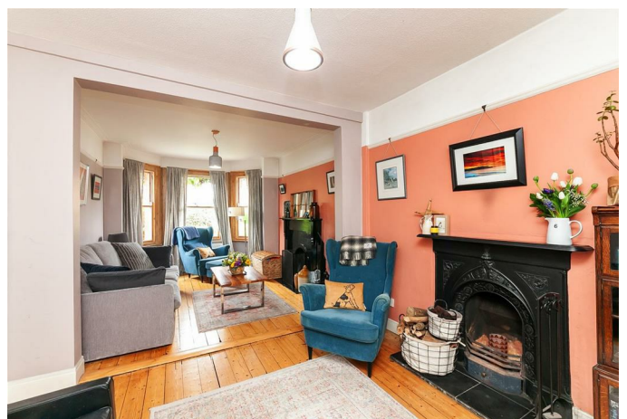
Cast iron fire-place. Floor boards sanded and stained. Bi folding doors providing access to extended kitchen/dining.