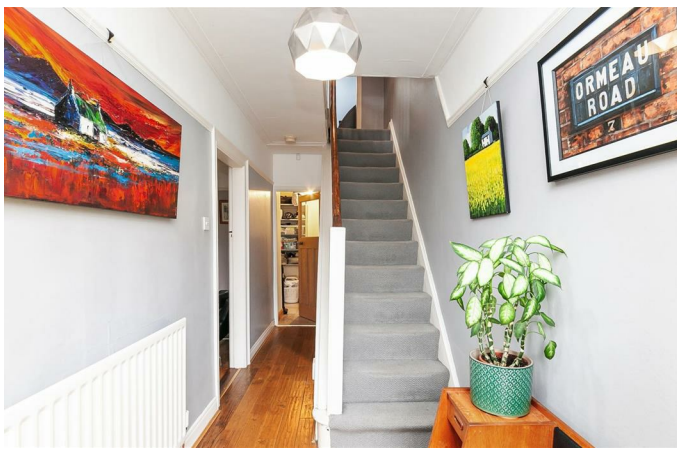
Hardwood stained glass panelled front door to entrance hall. Timber flooring.