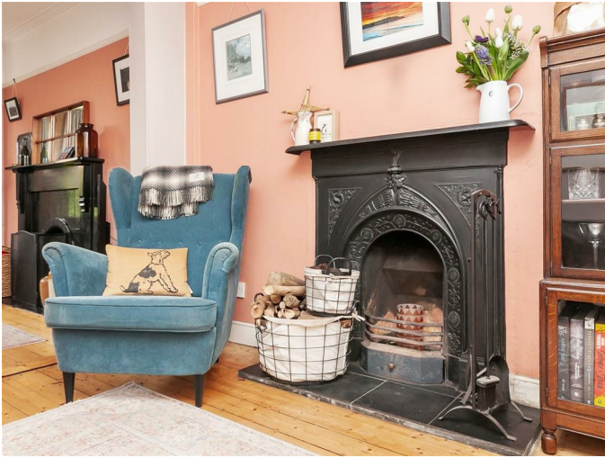
Kitchen/Dining/Living 18'0 x 15'3 (5.49m x 4.65m)