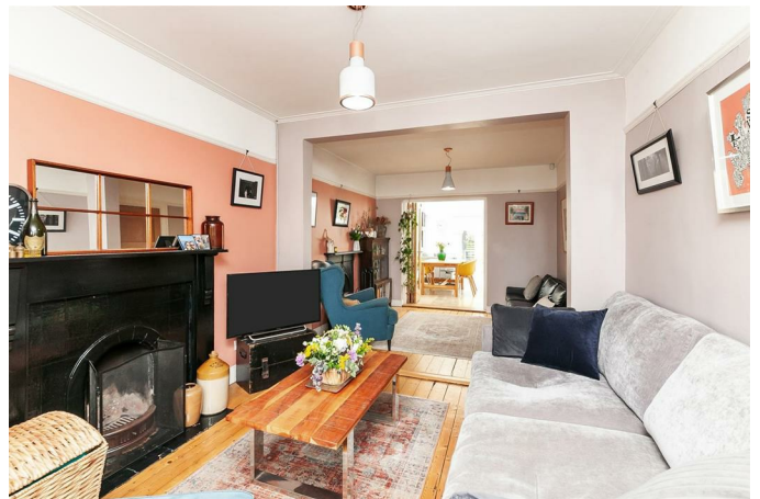
Living Room 12'3 x 10'0 (3.73m x 3.05m)