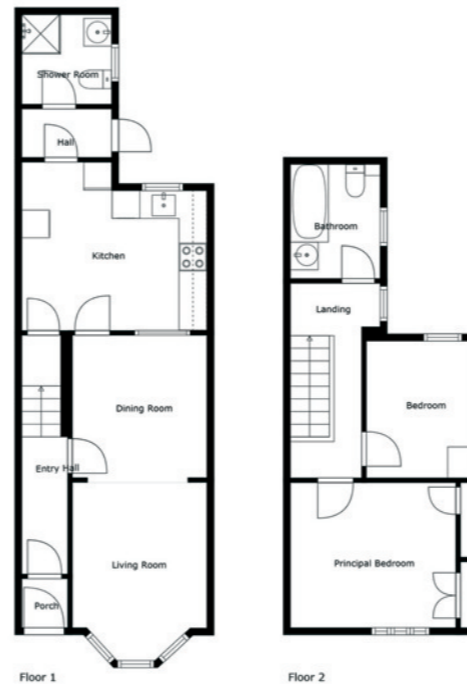
Sizes And Dimensions Are Approximate. Actual May Vary.