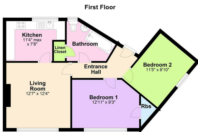
36D Windmill Gardens, Ballynahinch

Terms & Conditions: Please note that these particulars do not constitute an offer or contract of sale. Any prospective purchaser should satisfy themselves by thorough inspection of the property and we recommend that any prospective purchaser should employ the professional services of a building surveyor and consider their findings prior to entering into contract. All such fees associated with this work will be the responsibility of the prospective purchaser regardless of whether the sale completes or not. In addition, none of the appliances or installations have been tested in any way whatsoever and it is our recommendation that a purchaser should fully satisfy themselves by employing an appropriate expert. We would also like to advise that our measurements are taken from the widest points of each room and should not be relied upon as completely accurate. You should not make decisions based on the measurements provided and double check measurements at all times. Valuation/Mortgage Service: As part of our service we would remind Vendors and potential purchasers that we have a Mortgage Broker available at this branch. If you are thinking of selling, we would be happy to carry out a free market appraisal of your property.