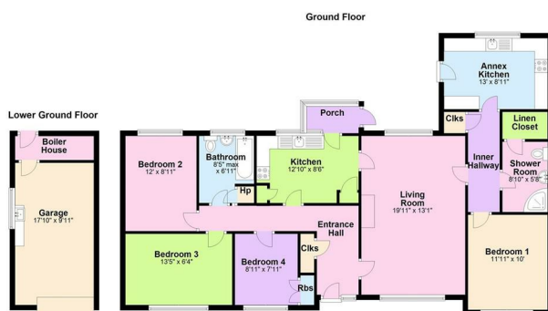
51 Roughal Park, Downpatrick

Terms & Conditions: Please note that these particulars do not constitute an offer or contract of sale. Any prospective purchaser should satisfy themselves by thorough inspection of the property and we recommend that any prospective purchaser should employ the professional services of a building surveyor and consider their findings prior to entering into contract. All such fees associated with this work will be the responsibility of the prospective purchaser regardless of whether the sale completes or not. In addition, none of the appliances or installations have been tested in any way whatsoever and it is our recommendation that a purchaser should fully satisfy themselves by employing an appropriate expert. We would also like to advise that our measurements are taken from the widest points of each room and should not be relied upon as completely accurate. You should not make decisions based on the measurements provided and double check measurements at all times. Valuation/Mortgage Service: As part of our service we would remind Vendors and potential purchasers that we have a Mortgage Broker available at this branch. If you are thinking of selling, we would be happy to carry out a free market appraisal of your property.