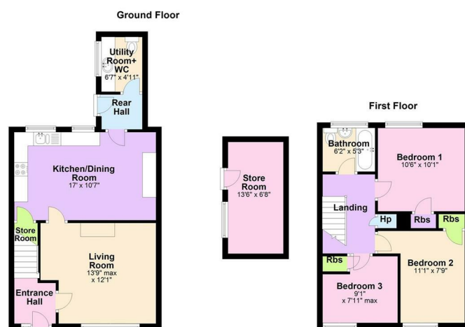
20 Linnhurst Park, Drumaness

Terms & Conditions: Please note that these particulars do not constitute an offer or contract of sale. Any prospective purchaser should satisfy themselves by thorough inspection of the property and we recommend that any prospective purchaser should employ the professional services of a building surveyor and consider their findings prior to entering into contract. All such fees associated with this work will be the responsibility of the prospective purchaser regardless of whether the sale completes or not. In addition, none of the appliances or installations have been tested in any way whatsoever and it is our recommendation that a purchaser should fully satisfy themselves by employing an appropriate expert. We would also like to advise that our measurements are taken from the widest points of each room and should not be relied upon as completely accurate. You should not make decisions based on the measurements provided and double check measurements at all times. Valuation/Mortgage Service: As part of our service we would remind Vendors and potential purchasers that we have a Mortgage Broker available at this branch. If you are thinking of selling, we would be happy to carry out a free market appraisal of your property.