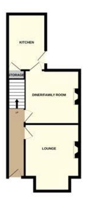
int is one