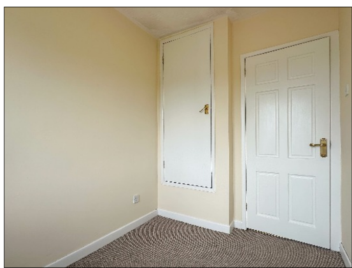
BEDROOM 3: 8' 2" x 6' 3" (2.50m x 1.90m) With access to Hot press.