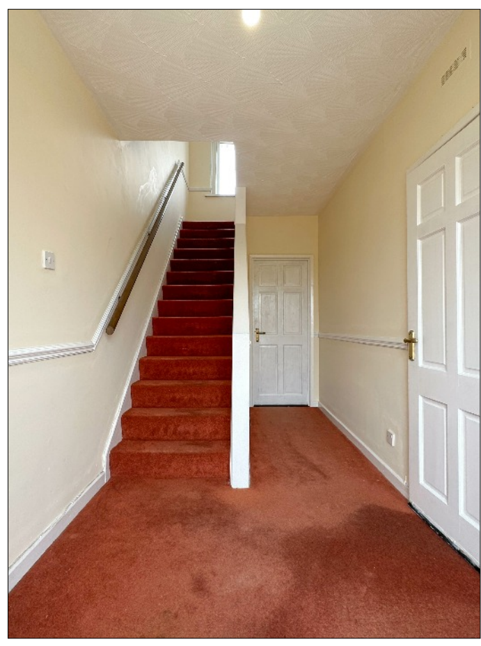
ENTRANCE HALL: With uPVC front entrance door, Telephone point, under stair storage.