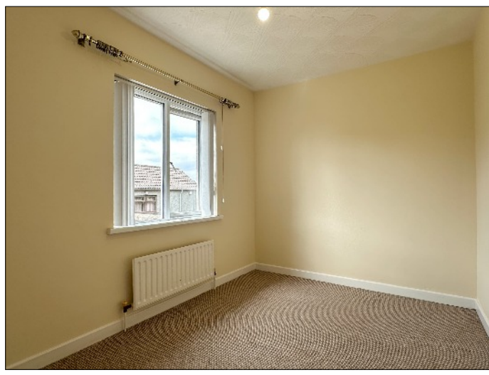
BEDROOM 2: 11' 7" x 7' 9" (3.54m x 2.35m)