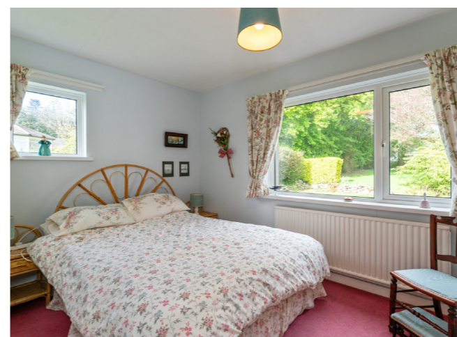
Bedroom 4 (ground floor)