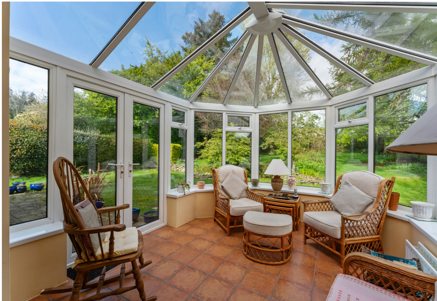
uPVC double glazed conservatory looking into private rear garden