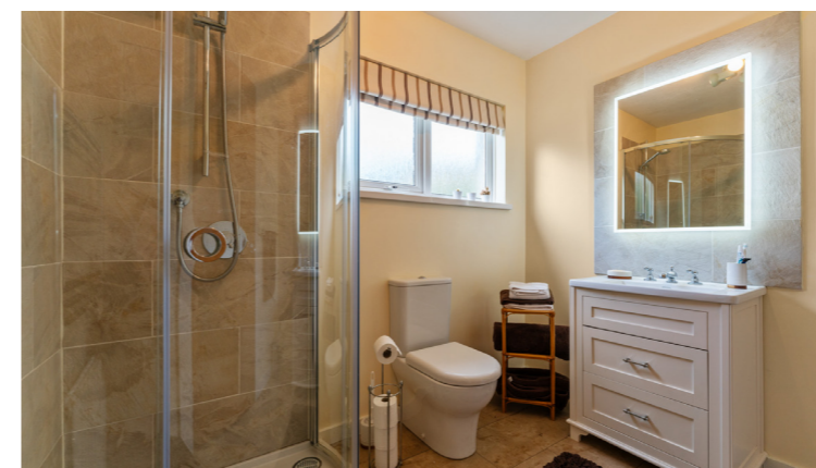
Downstairs shower room