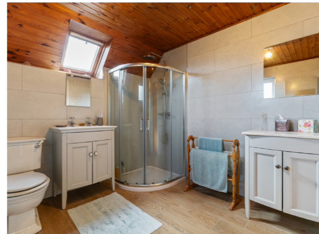
First floor shower room