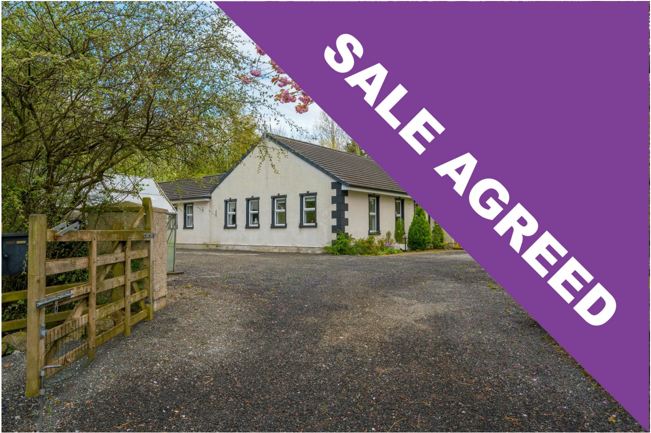
19 Ballysculty Road, Muckamore, BT41 4QU