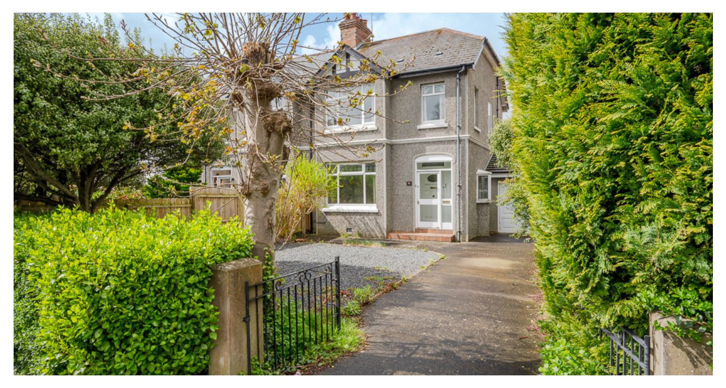
SEMI-DETACHED | 3 ⊨ | 1 ≒ | 2 ⊟

Presenting a rare and unique opportunity, this attractive extended semi detached property allows the lucky new purchaser to own a fantastic home in the heart of the ever popular Baylands area of Ballyholme.