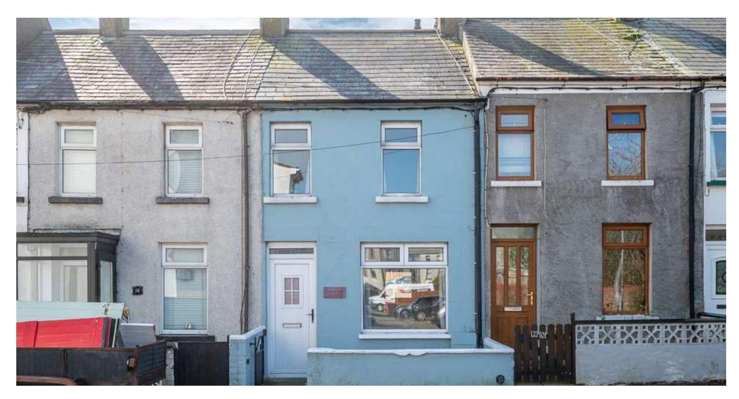
MID TERRACE | 2 ⊨ | 1 ≒ | 1 + ⊟

Located in the heart of Donaghadee's thriving town centre, this is an ideal opportunity to purchase an attractive mid terrace property. Well presented throughout there is little left to do but move your furniture in and enjoy.