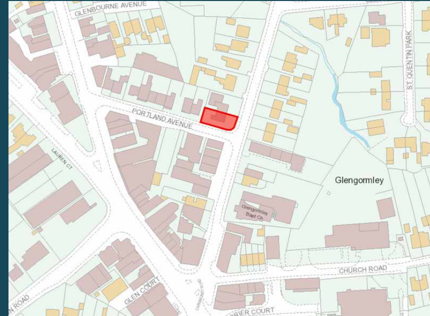
Layout Plan - Not to Scale

McKIBBIN COMMERCIAL PROPERTY CONSULTANTS for themselves and the vendors or lessors of this property whose agents they are given notice that: 1) The particulars are produced in good faith, are set out as a general guide only and do not constitute any part of the contract; 2) No person in the employment of McKIBBIN COMMERCIAL PROPERTY CONSULTANTS has any authority to make or give any representation or warranty whatever in relation to this property. As a business carrying out estate agency work when we enter into a relationship with a customer, we are required, if applicable, to verify the identity of both vendor and purchaser as outlined in the Money Laundering, Terrorist Financing and Transfer of Funds (Information on the Payer) Regulations 2017 – http://www.legislation.gov.uk/uksi/2017/692/made . In accordance with legislation, any information and documentation provided by you will be held for a period of five years from when you cease to have a contractual relationship with McKibbin Commercial. The information will be held in accordance with the General Data Protection Regulations (GDPR) and will not be passed on to any other party unless we are required to do so by law.