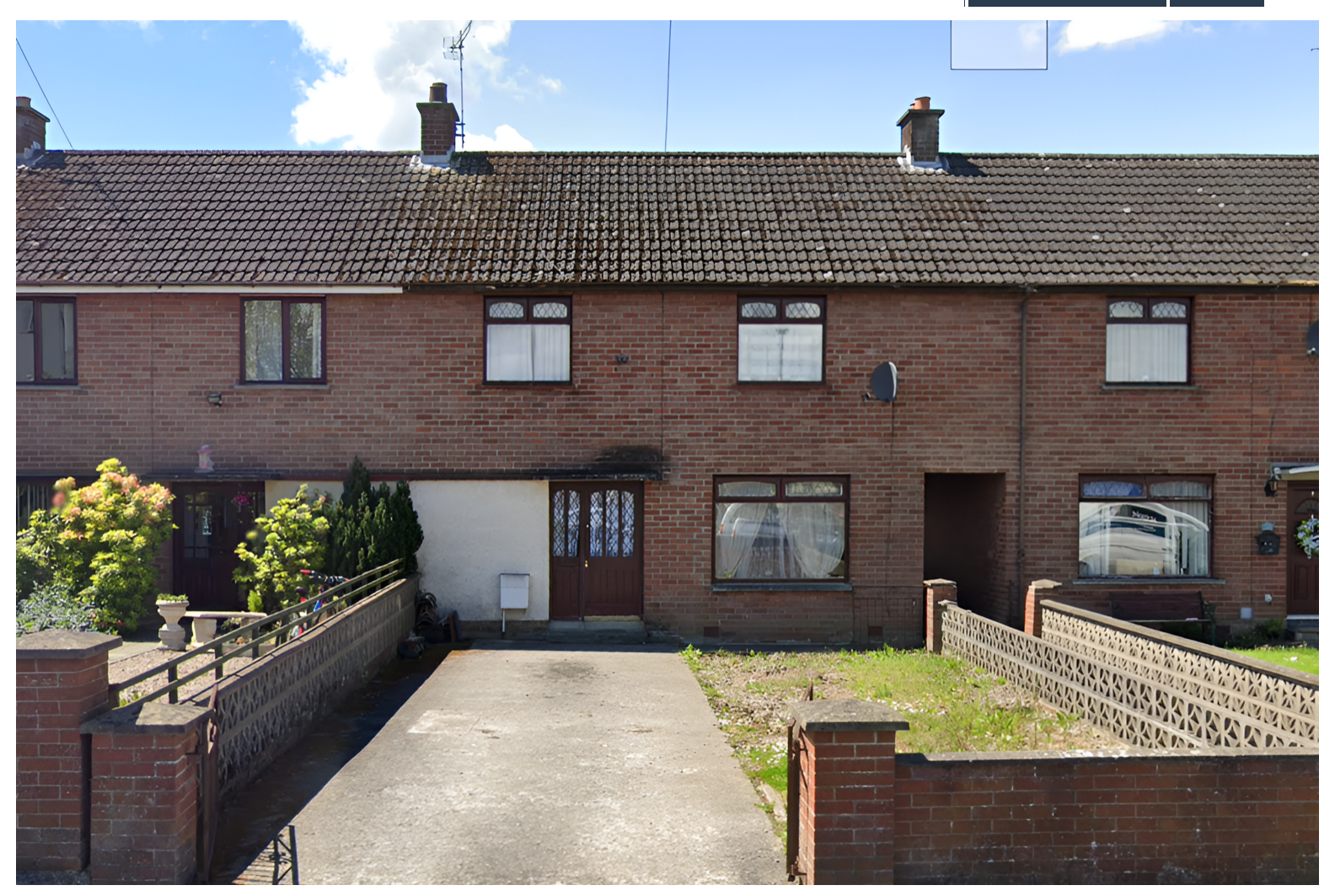
Spacious mid terraced property in a highly regarded area within walking distance of schools and shops