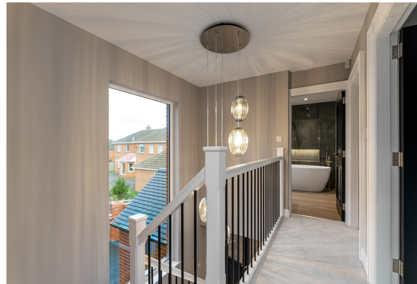
Entrance hall with minstrel gallery, feature lighting and tall picture window

Staircase with large, bright double glazed window to: