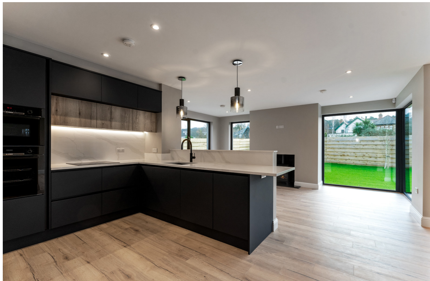
Stunning kitchen / living dining space opening out to patio and enclosed garden