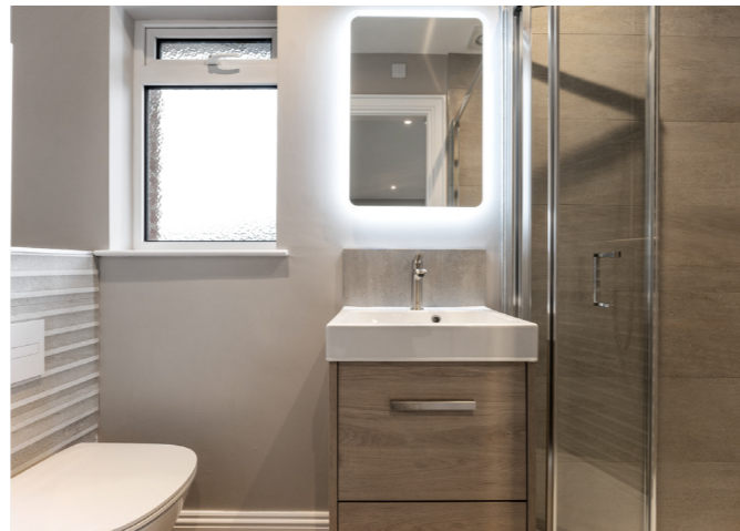
En suite to Bedroom 2