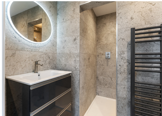
Beautiful en suite to Bedroom 1