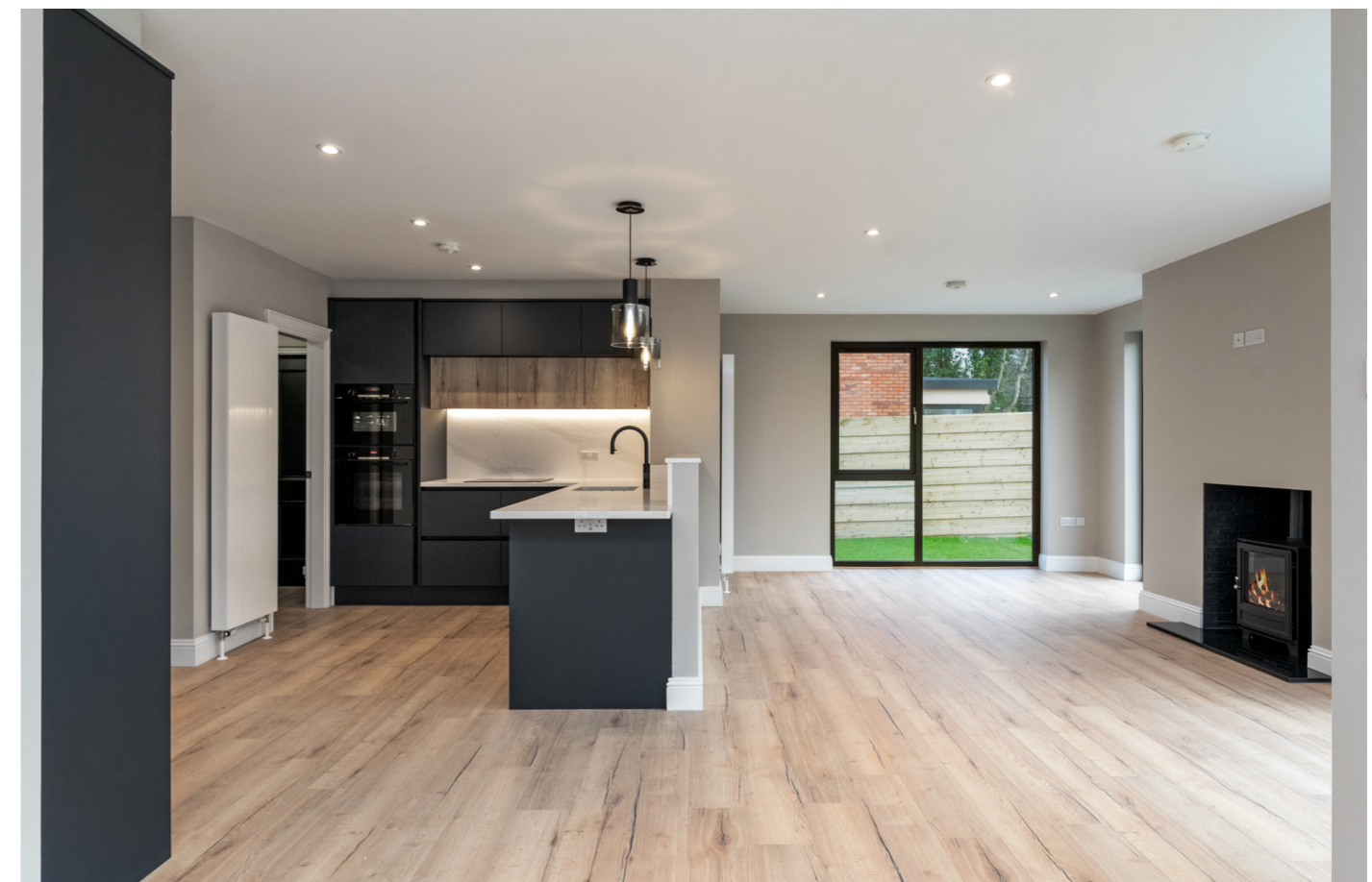
Complete with appliances and Quooker boiling hot water tap