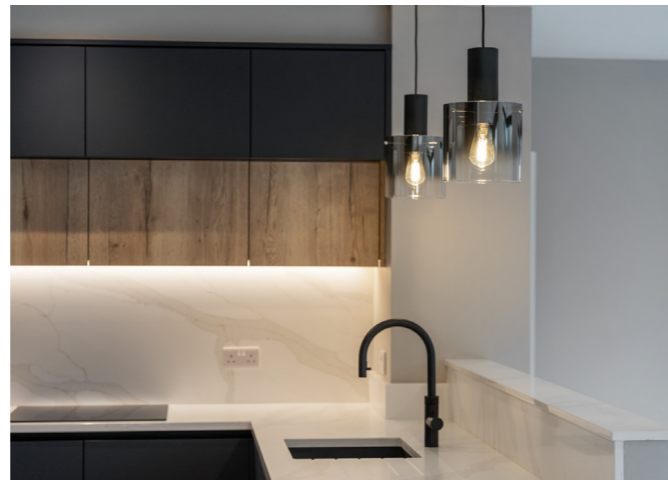
Quooker boiling water tap