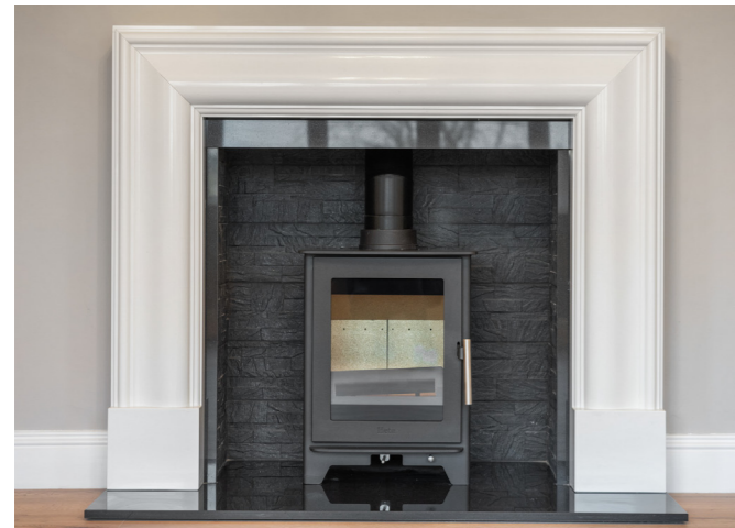
Log burning fire in Drawing Room