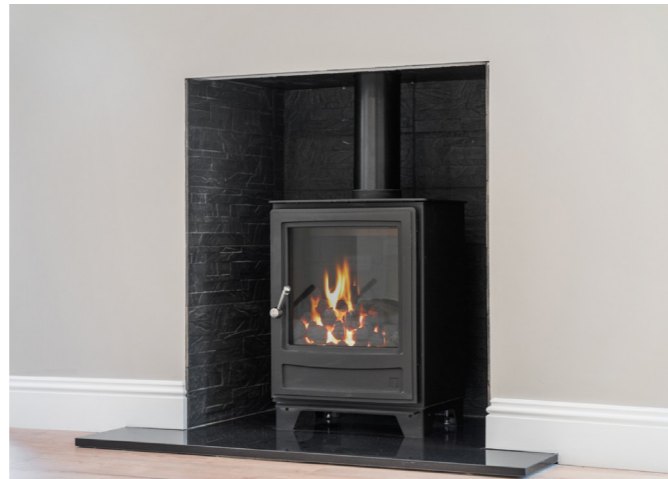
Gas fire in Family Room