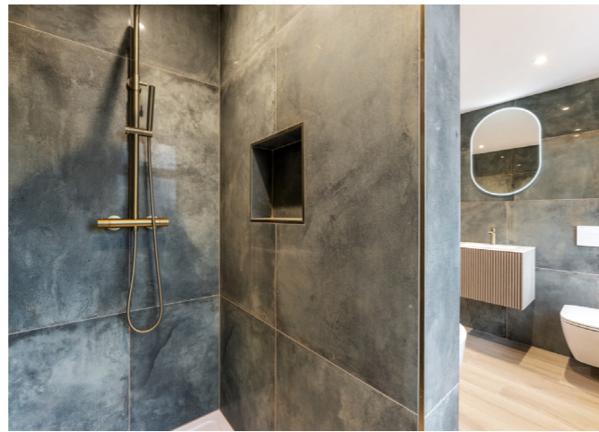
Bathroom with feature free standing bath and concealed shower cubicle