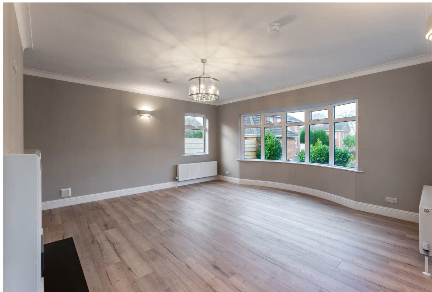
Drawing room with fireplace and bow window