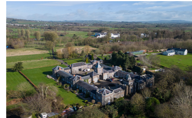
Views over The Adam Yard to the Kingfisher Country Estate