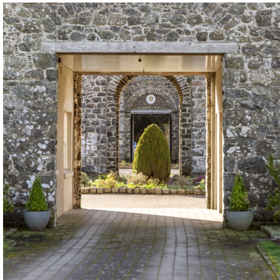
Archway leading to the Courtyard