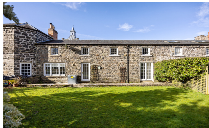
Entrance to the rear of The Adam Yard

Travelling from the Templepatrick roundabout towards Parkgate turn left into the Kingfisher Country Estate. Continue on the drive and when the drive swings right towards the Golf Course Hotel & Spa keep left onto a private drive, on the left there are electric cast iron gates. This is a private access to The Adam Yard.