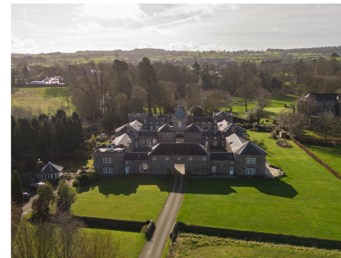
Entrance to the rear of The Adam Yard