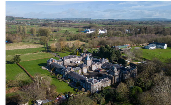
Views over The Adam Yard to the Kingfisher Country Estate