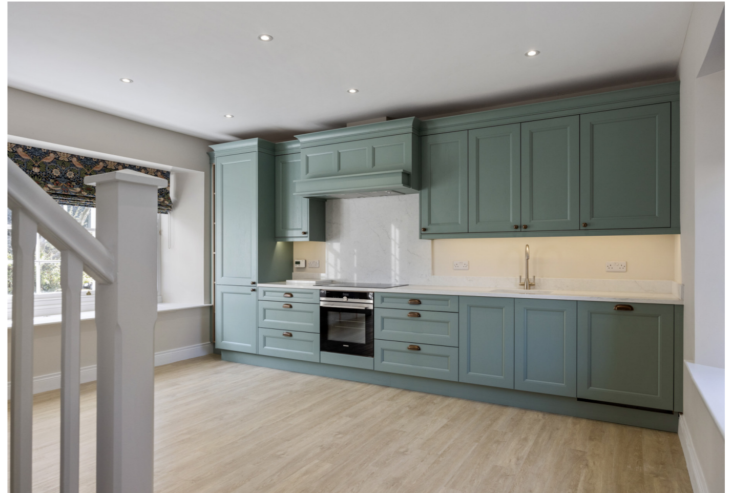
Hand crafted kitchen