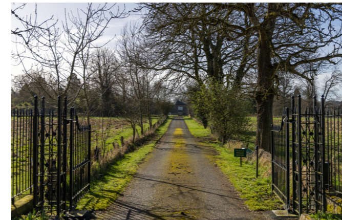
Electric gates to The Adam Yard