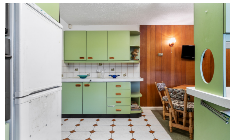
Kitchen and breakfast area