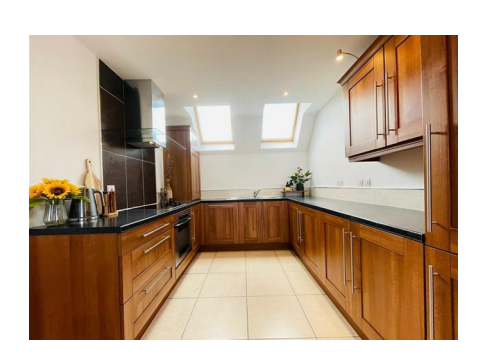
9 Appletree Lane Doagh Road, Newtownabbey, BT37 9EP