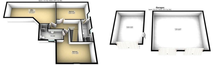
Total area: approx. 404.9 sq. metres (4358.2 sq. feet) 23a Clady Road, Dunadry