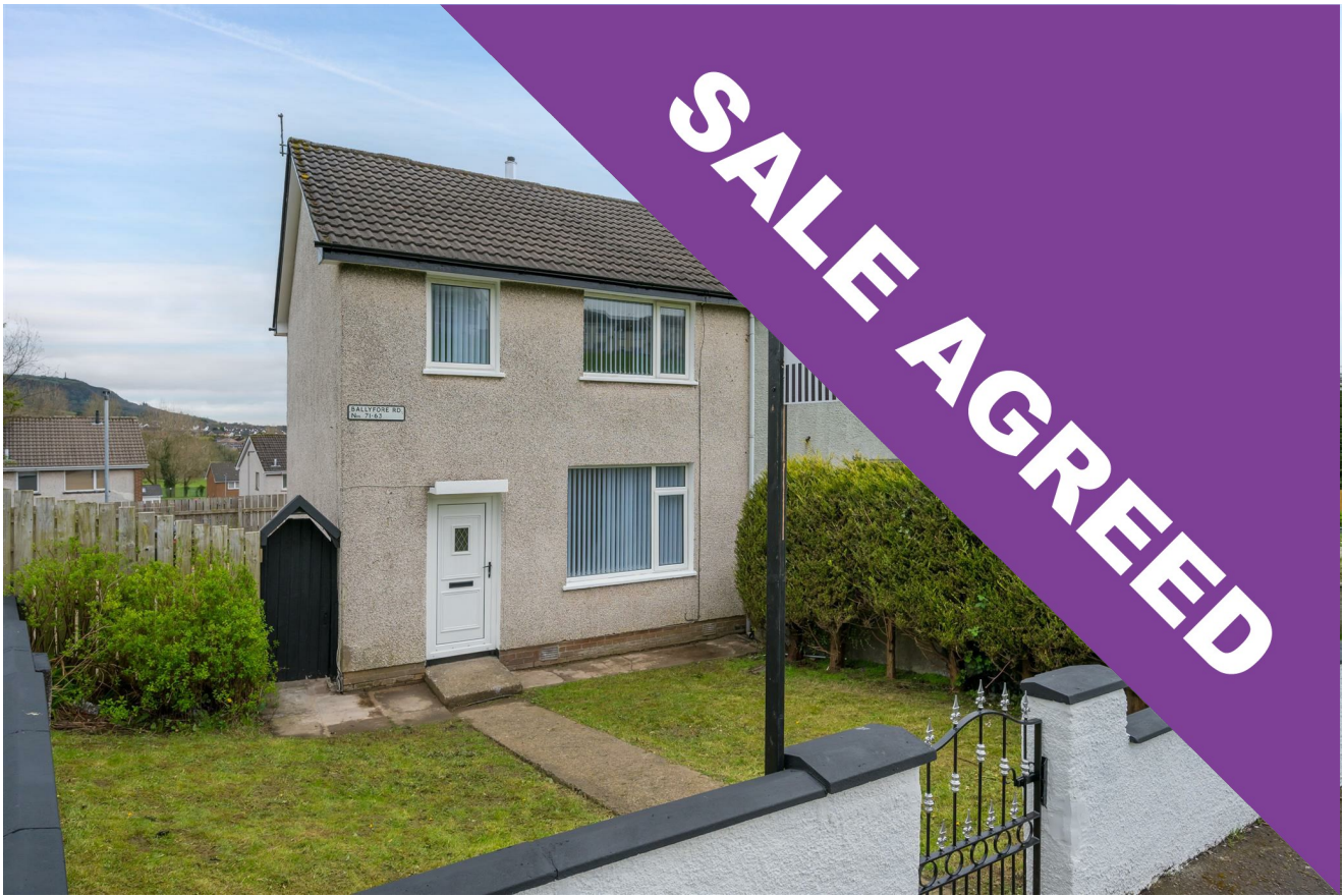
71 Ballyfore Road, Newtownabbey, BT36 6XT