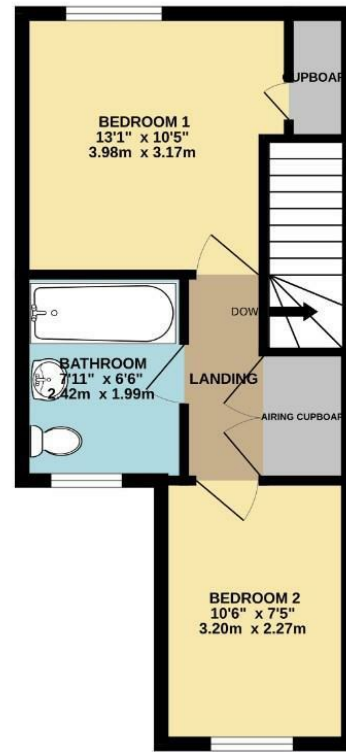
1ST FLOOR 325 sq.ft. (30.2 sq.m.) approx.