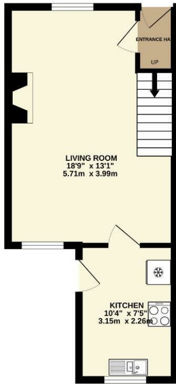
GROUND FLOOR 318 sq.ft. (29.5 sq.m.) approx.