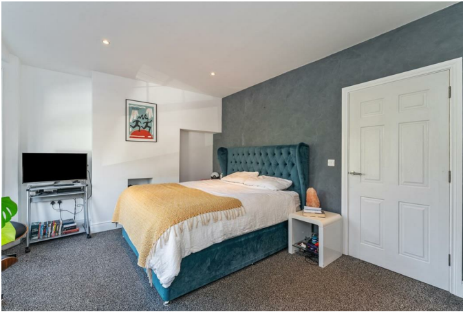
Bedroom Two 10'9 x 8'1 (3.28m x 2.46m)