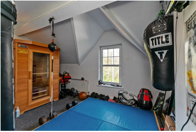
Bedroom Four 11'6 x 8'9 (3.51m x 2.67m)