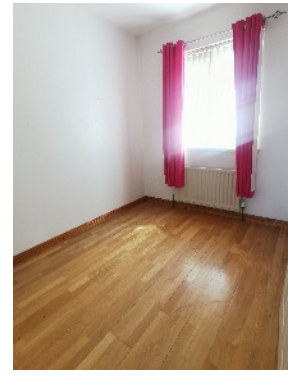
9'5 x 7'7 Laminate wooden floor.

Main Bathroom: 7'8 x 6'11 tiled, floor tiled.