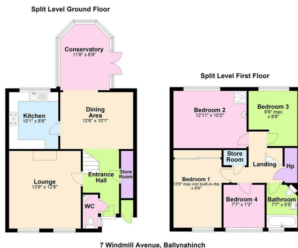
7 Windmill Avenue, Ballynahinch

Terms & Conditions: Please note that these particulars do not constitute an offer or contract of sale. Any prospective purchaser should satisfy themselves by thorough inspection of the property and we recommend that any prospective purchaser should employ the professional services of a building surveyor and consider their findings prior to entering into contract. All such fees associated with this work will be the responsibility of the prospective purchaser regardless of whether the sale completes or not. In addition, none of the appliances or installations have been tested in any way whatsoever and it is our recommendation that a purchaser should fully satisfy themselves by employing an appropriate expert. We would also like to advise that our measurements are taken from the widest points of each room and should not be relied upon as completely accurate. You should not make decisions based on the measurements provided and double check measurements at all times. Valuation/Mortgage Service: As part of our service we would remind Vendors and potential purchasers that we have a Mortgage Broker available at this branch. If you are thinking of selling, we would be happy to carry out a free market appraisal of your property.