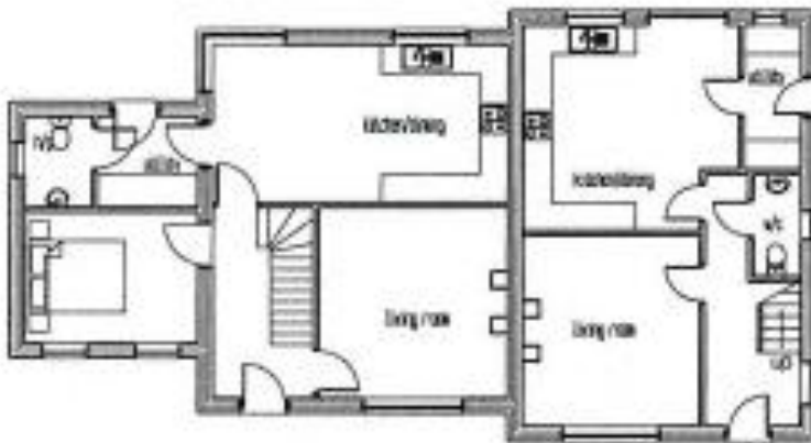
ground floor plan