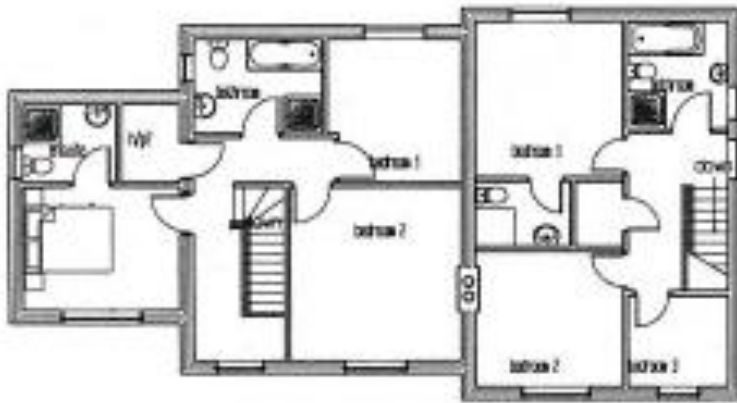
first floor plan