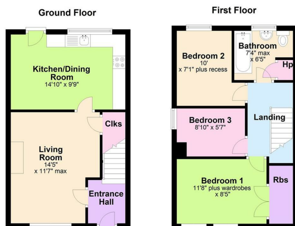
31 Windmill Drive, Ballynahinch

Terms & Conditions: Please note that these particulars do not constitute an offer or contract of sale. Any prospective purchaser should satisfy themselves by thorough inspection of the property and we recommend that any prospective purchaser should employ the professional services of a building surveyor and consider their findings prior to entering into contract. All such fees associated with this work will be the responsibility of the prospective purchaser regardless of whether the sale completes or not. In addition, none of the appliances or installations have been tested in any way whatsoever and it is our recommendation that a purchaser should fully satisfy themselves by employing an appropriate expert. We would also like to advise that our measurements are taken from the widest points of each room and should not be relied upon as completely accurate. You should not make decisions based on the measurements provided and double check measurements at all times. Valuation/Mortgage Service: As part of our service we would remind Vendors and potential purchasers that we have a Mortgage Broker available at this branch. If you are thinking of selling, we would be happy to carry out a free market appraisal of your property.