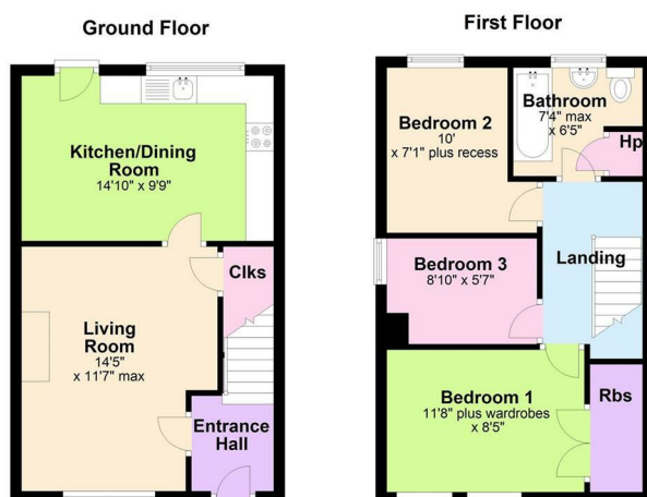
31 Windmill Drive, Ballynahinch

Terms & Conditions: Please note that these particulars do not constitute an offer or contract of sale. Any prospective purchaser should satisfy themselves by thorough inspection of the property and we recommend that any prospective purchaser should employ the professional services of a building surveyor and consider their findings prior to entering into contract. All such fees associated with this work will be the responsibility of the prospective purchaser regardless of whether the sale completes or not. In addition, none of the appliances or installations have been tested in any way whatsoever and it is our recommendation that a purchaser should fully satisfy themselves by employing an appropriate expert. We would also like to advise that our measurements are taken from the widest points of each room and should not be relied upon as completely accurate. You should not make decisions based on the measurements provided and double check measurements at all times. Valuation/Mortgage Service: As part of our service we would remind Vendors and potential purchasers that we have a Mortgage Broker available at this branch. If you are thinking of selling, we would be happy to carry out a free market appraisal of your property.