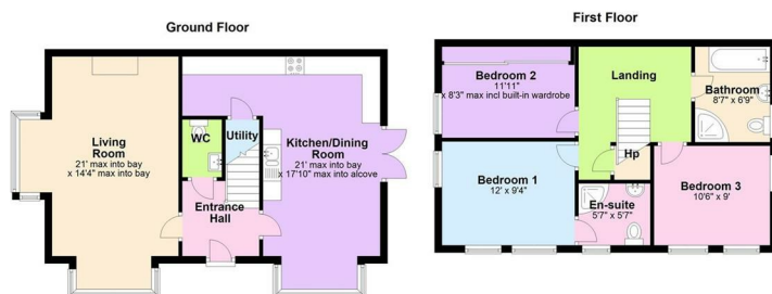
40 Magheraknock Park, Ballynahinch

Terms & Conditions: Please note that these particulars do not constitute an offer or contract of sale. Any prospective purchaser should satisfy themselves by thorough inspection of the property and we recommend that any prospective purchaser should employ the professional services of a building surveyor and consider their findings prior to entering into contract. All such fees associated with this work will be the responsibility of the prospective purchaser regardless of whether the sale completes or not. In addition, none of the appliances or installations have been tested in any way whatsoever and it is our recommendation that a purchaser should fully satisfy themselves by employing an appropriate expert. We would also like to advise that our measurements are taken from the widest points of each room and should not be relied upon as completely accurate. You should not make decisions based on the measurements provided and double check measurements at all times. Valuation/Mortgage Service: As part of our service we would remind Vendors and potential purchasers that we have a Mortgage Broker available at this branch. If you are thinking of selling, we would be happy to carry out a free market appraisal of your property.