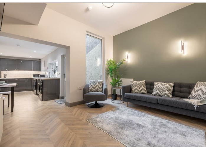
These particulars, whilst believed to be accurate are set out as a general outline only for guidance and do not constitute any part of an offer or contract. Intending purchasers should not rely on them as statements of representation of fact, but must satisfy themselves by inspection or otherwise as to their accuracy. No person in this firms employment has the authority to make or give any representation or warranty in respect of the property.