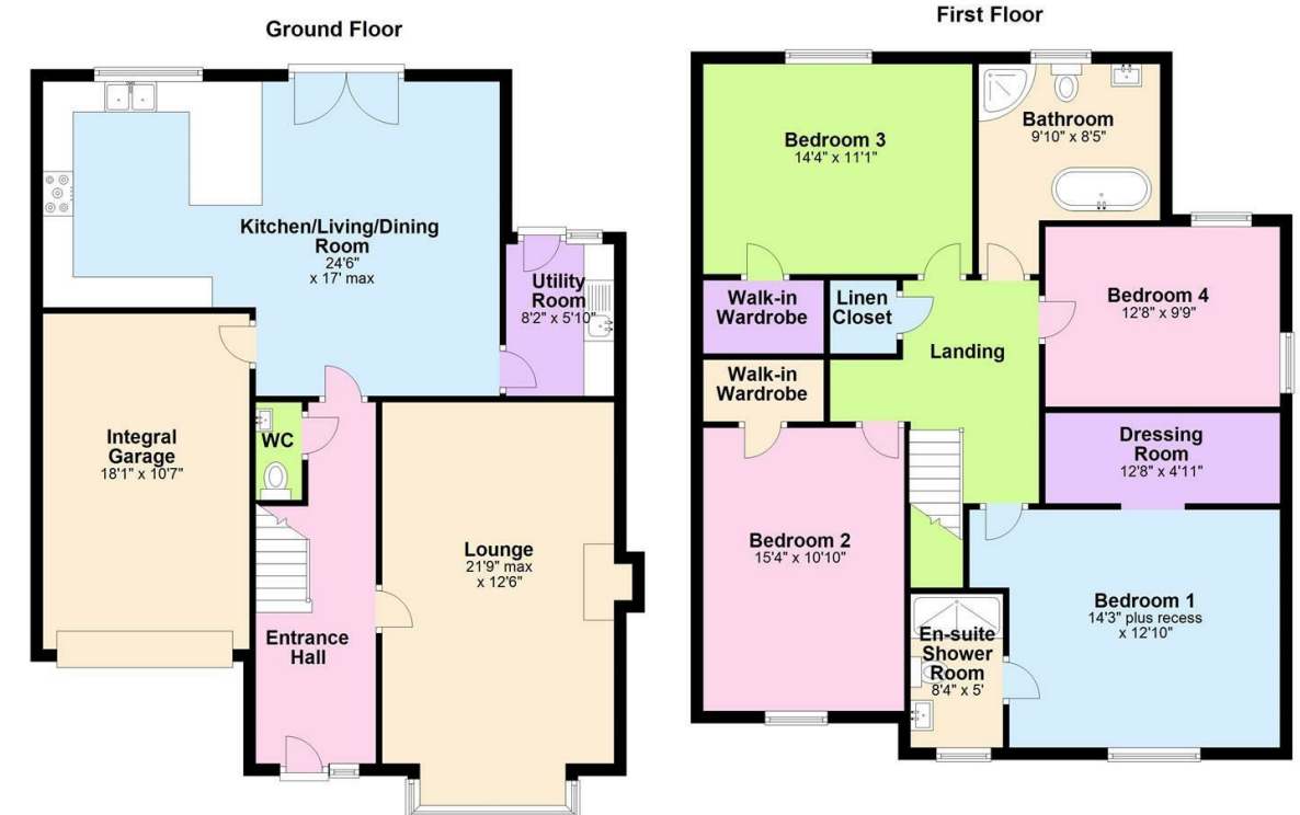
1 Spa Manor, Spa, Ballynahinch

Garden area to front with dual tarmac parking space. Enclosed garden to rear with patio area enclosed by fencing and mature hedging.