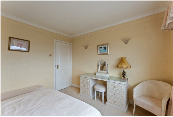
Bedroom Four 11'7 x 10'1 (3.53m x 3.07m)