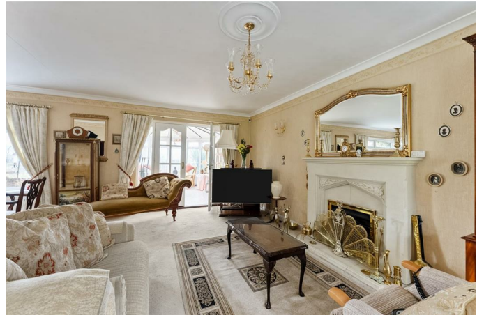
At widest points. Sandstone fire-place housing coal effect gas fire. From dining area double doors to pvc conservatory.