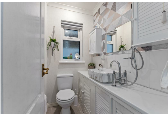
Marble effect sink unit with mixer taps with hand shower, low flush w.c Part tiled walls. Tiled flooring.