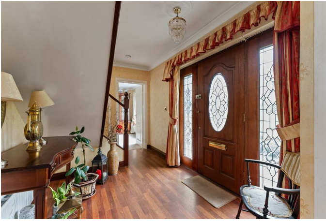
Open entrance porch Hardwood glass panelled front door with side panels to entrance hall. Laminate flooring. Built in storage.