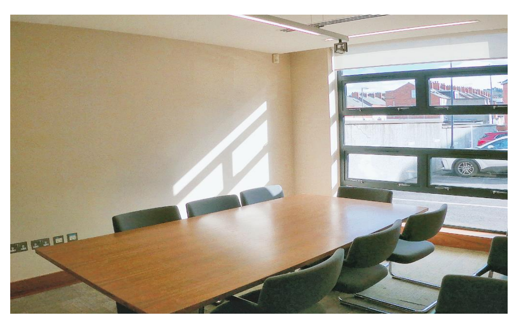
Avison Young | 67-69 Church View, Holywood – To Let