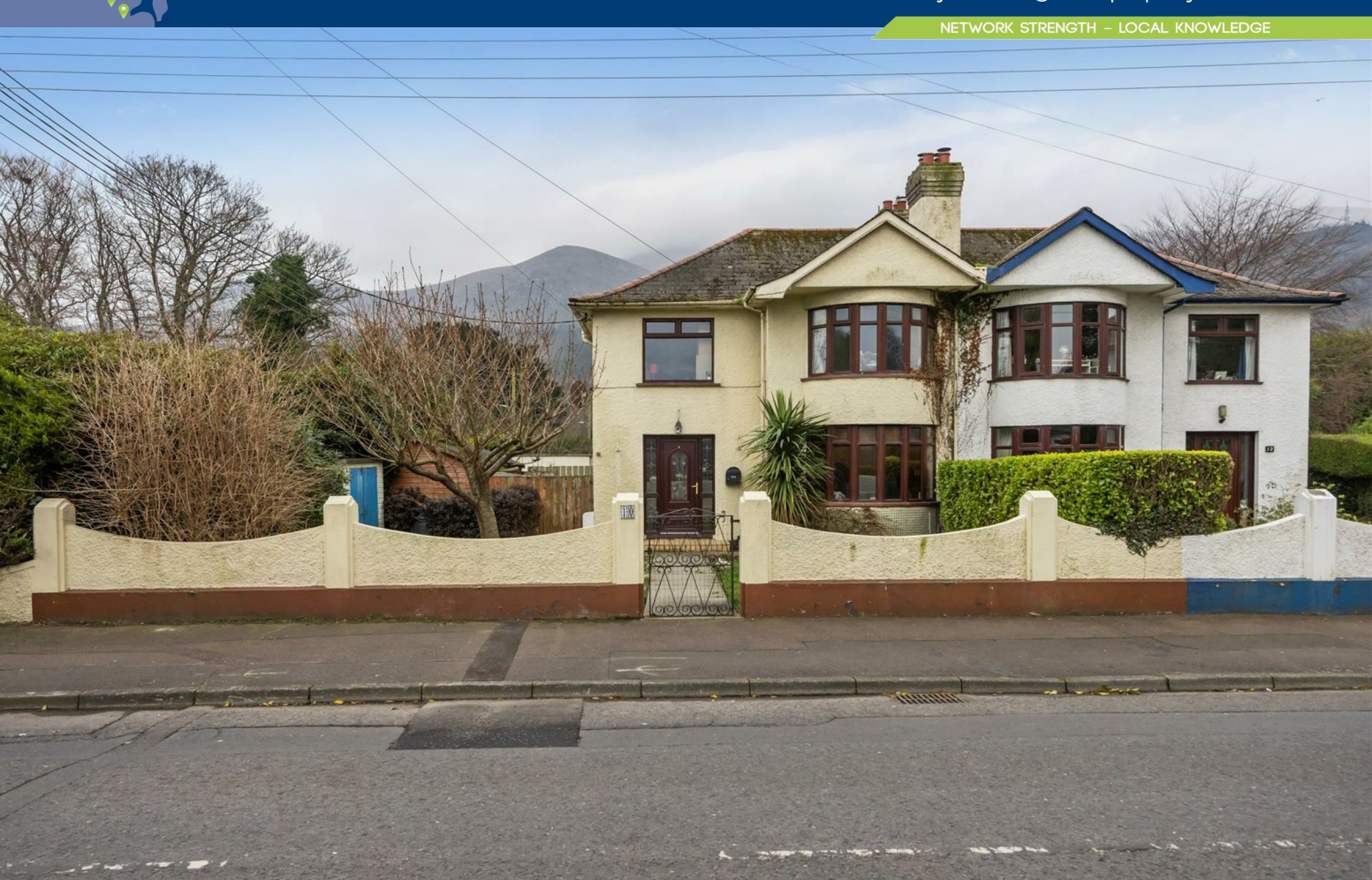
10 TULLYBRANNIGAN ROAD, NEWCASTLE, DOWN, BT33 0DX